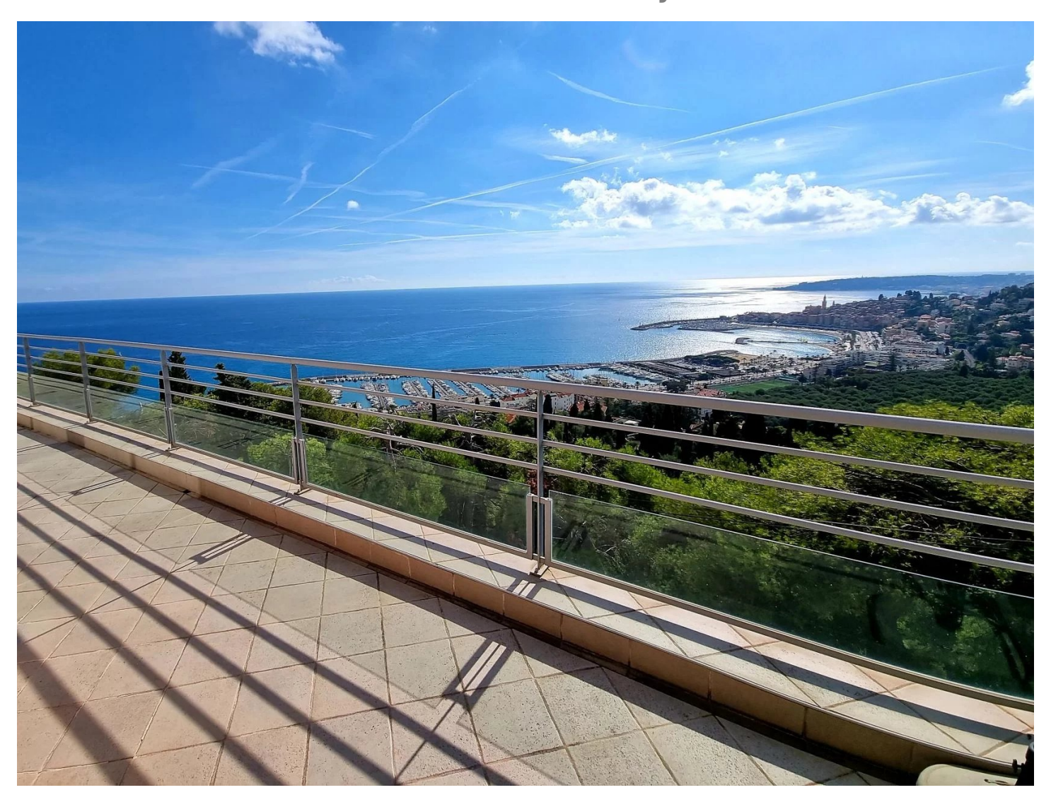
150 \text{ m}^2 - 5 \text{ rooms} - 4 \text{ bedrooms} Reference: V573vm

MENTON GARAVAN, Colombières district, superb modern villa with an area of around 150 m², enjoying magnificent terraces of around 120 m<sup>2</sup>, a cellar, a large double garage, parking spaces and a breathtaking sea view over the bay of Garavan, Old city of MENTON, Cap Martin and Italy, land of 1422 m2. Swimming pool license accepted, lots of potential, rare product on a unique location!